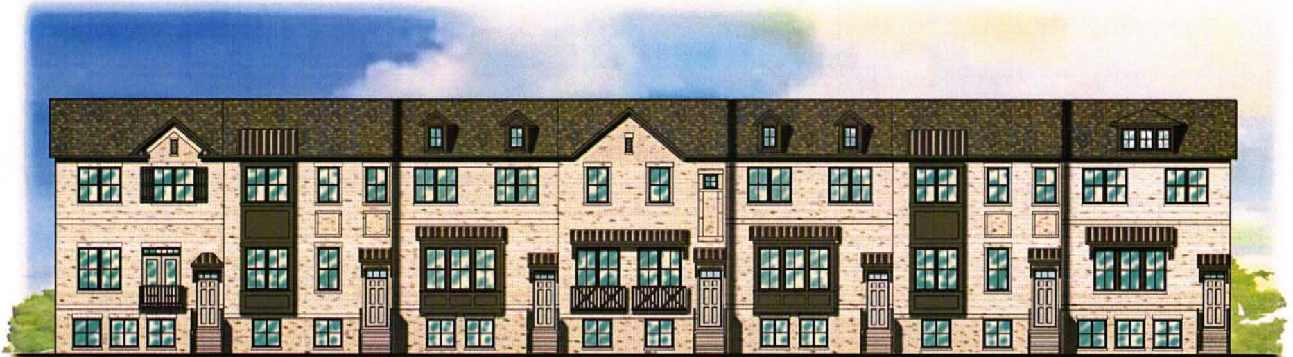
FRONT ELEVATION - FCB