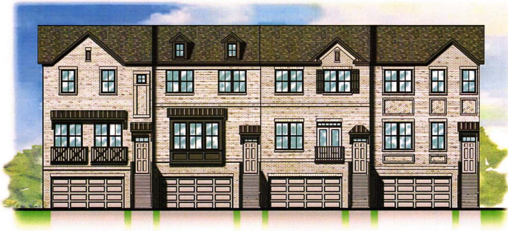
FRONT ELEVATION - ULC