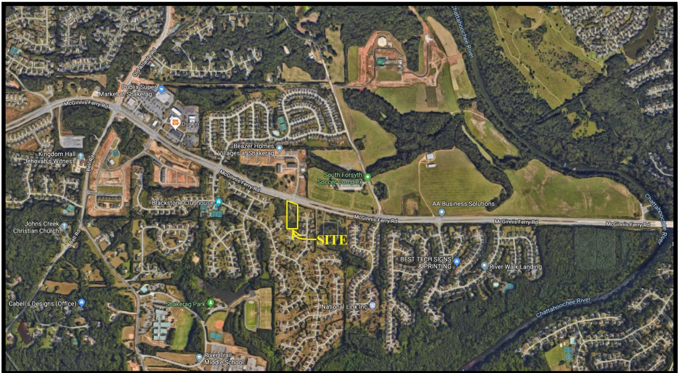
Figure 1 – Site Location Map

The trip generation was calculated for a proposed dentist office in the City of Suwanee, Georgia. The site is located at 8125 McGinnis Ferry Road as shown in Figure 1. The proposed site plan is presented in Figure 2.